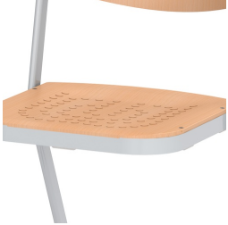
Seat surface with pressed-in, anti-slip knobs