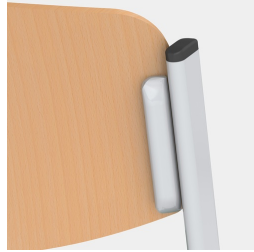
Seat and back concealed screwed