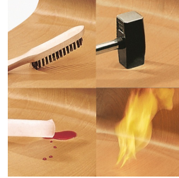
Seat and back melamine coated: scratch, break and impact resistant; flame retardant