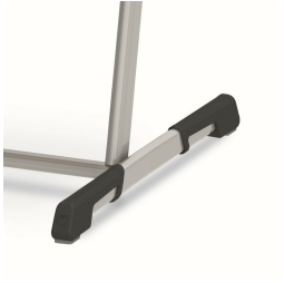
Floor protectors with integrated step protection