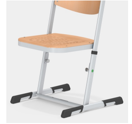
Stable, height-adjustable sled frame