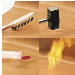
Seat and back melamine coated: scratch, break and impact resistant; flame retardant