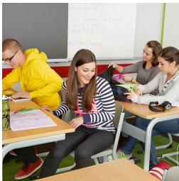
No disturbance of the chair legs when getting in and out of the chair