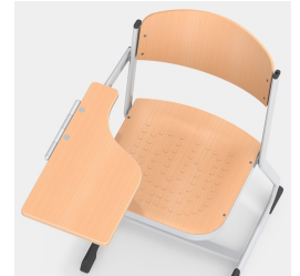
Stable and solid C-shape frame with writing surface