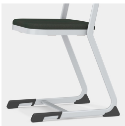
Stable and solid C-shape frame