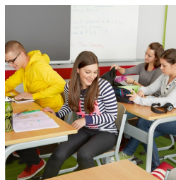
No disturbance of the chair legs when getting in and out of the chair