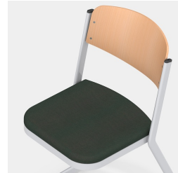
With seat upholstery