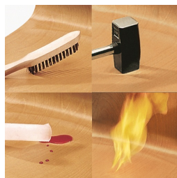
Seat and back melamine coated: scratch, break and impact resistant; flame retardant