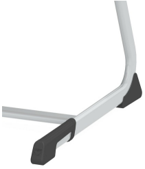
Floor protectors with integrated step protection