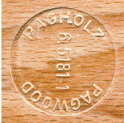
PAGHOLZ® from sustainable forestry