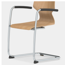
Robust cantilever frame with armrest