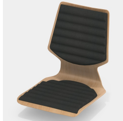
Optionally with seat and back wave upholstery