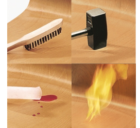
Indestructible PAGHOLZ® shell, scratch, break and impact resistant; flame retardant