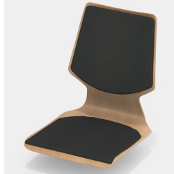
Optionally with seat and back flat upholstery