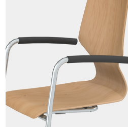
Including armrest with black softgrip cover