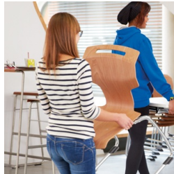
Easy to carry due to light weight