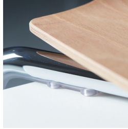
Plate and edge protectors protect the table when it is upended