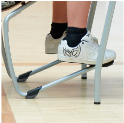
Robust C-shape frame with A2S FLOORSAFE® floor protectors