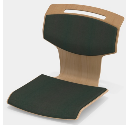
Optionally with seat and backrest upholstery