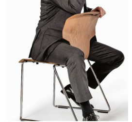
Shell design allows different seating positions, even reverse