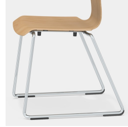
Slender, stable sled frame