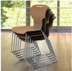
Stackable up to 7 chairs (without upholstery)