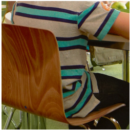
Ergonomically shaped and flexible shell