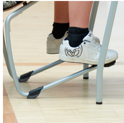
Robust C-shape frame with A2S FLOORSAFE® floor protectors