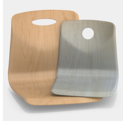
Optionally with grip hole, round or oval (not with backrest upholstery)