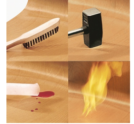
Indestructible PAGHOLZ® shell, scratch, break and impact resistant; flame retardant