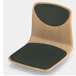
Optionally with seat and backrest upholstery (only sizes 6E, 7)