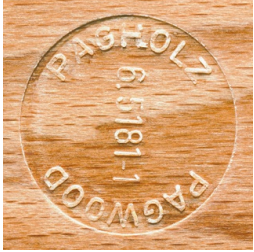
PAGHOLZ® from sustainable forestry