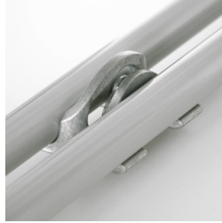
Optionally with row connection from size 5