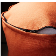
Cover removable by zipper