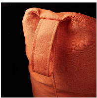
With handle for easy carrying