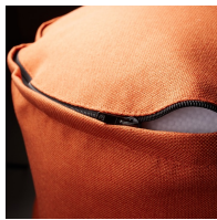
Cover removable by zipper