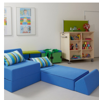
Space saving stowable