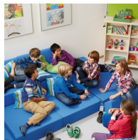
Versatile use due to fold-out function