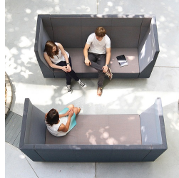
Ideal as a room-in-room solution