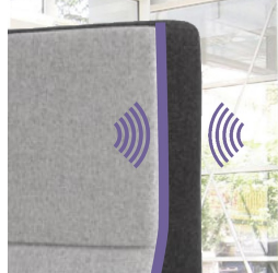
Sound insulation through sound-absorbing foam in backrest