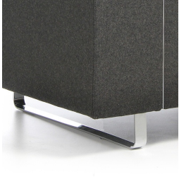
Stable sled frame