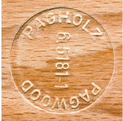
PAGHOLZ® from sustainable forestry