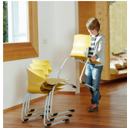
Stackable up to 5 chairs (without upholstery)