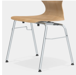
Robust 4-leg frame