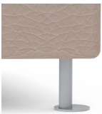
Sturdy round tube frame optionally chrome-plated