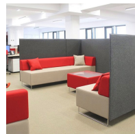
Individually extendable through interlinkable elements