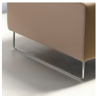
Stable sled frame optionally chrome-plated