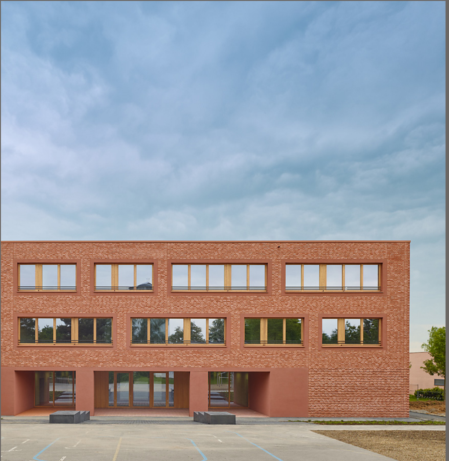
FIRSTWALD PROTESTANT HIGH SCHOOL, KUSTERDINGEN