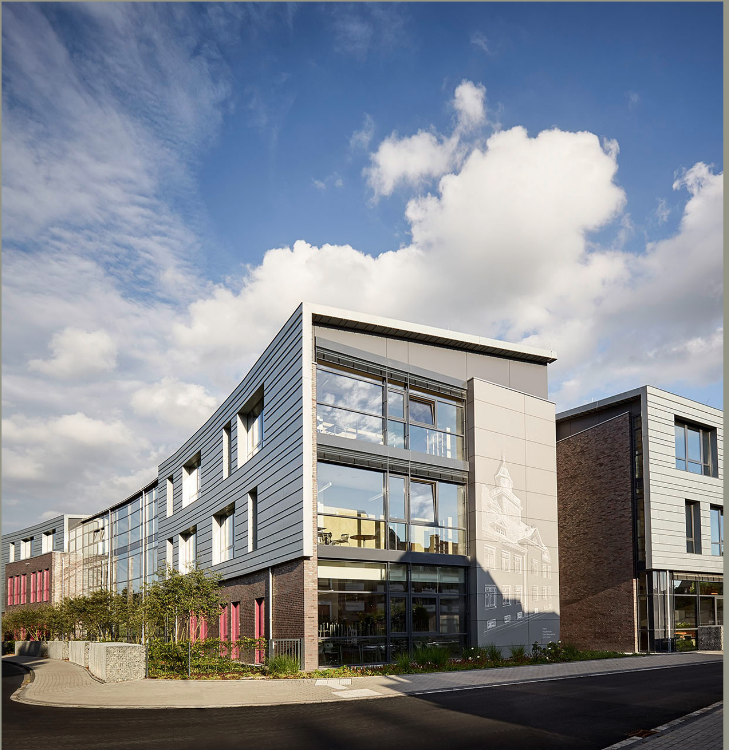
MUNICIPAL COMPREHENSIVE SCHOOL LANGENFELD